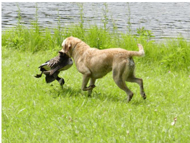
Millet was the only dog to retrieve the goose, leave it to a Chessie to get the job done!

The weather was quite warm but we were able to keep all the dogs cool and hydrated as well as the helpers. The club provided lunch and several people brought dishes to pass; it was a great weekend for the Club and dogs. Thank you to all that participated and helped out behind the scenes. ✨