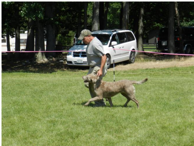
Mid-day there was a water and field demonstration.